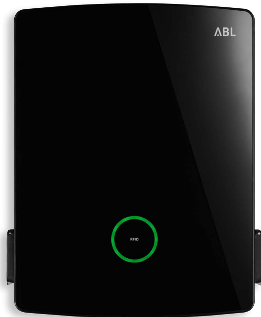
Product number 100000020

The robust design and high-quality workmanship of the Wallbox eM4 Twin protect it from external influences. The wallbox comes pre-installed and ready for connection thanks to the integrated Type A RCCB and DC residual current detection. All ABL wallboxes are made in Germany and comply with the highest safety standards.