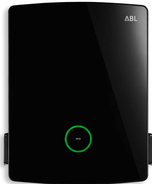
Product number 100000023

The robust design and high-quality workmanship of the Wallbox eM4 Twin protect it from external influences. The wallbox comes pre-installed and ready for connection thanks to the integrated Type A RCCB and DC residual current detection. All ABL wallboxes are made in Germany and comply with the highest safety standards.