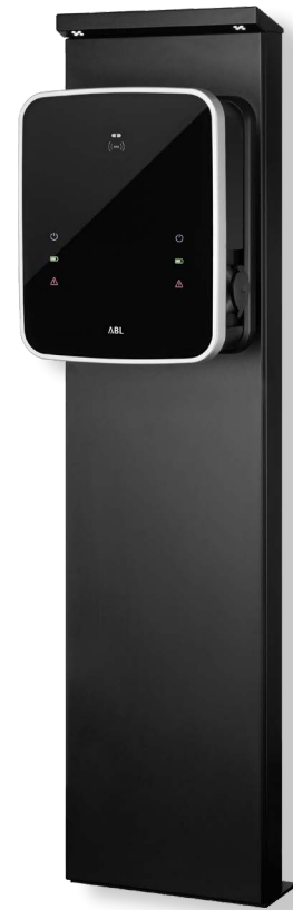
Separately available Wallbox eMH3 not included

The STEMH30 mounting pole is designed for the outdoor installation of all ABL Wallboxes eMH3. The STEMH30 impresses with its attractive and compact metal housing, including rear access protecting the internal components. The LEDs with twilight sensor integrated at the top end ensure sufficient illumination of the wallbox, even in difficult lighting conditions: Installing a suitable upstream fuse (2 A, 1-pole, C characteristic) for the integrated mains adapter is recommended. For maximum stability, ABL recommends installing the STEMH30 on the optionally available EMH9999 prefabricated concrete foundation.